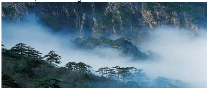
Photo: Xing'an Larch Forest Heilongjiang Province

Over the four weeks of Spring Festival last year, literally a month after the line was in full operation, the number of daily travelers on the rail system exceeded 168,000. By next year the system connecting the three provinces will be complete. The expansion of high speed rail service will open up commerce flowing from these linked cities throughout the northeast region of China to the world. It will also create barrier free tourism. Planning has been underway to create the formation of an ecological tourism zone which will include the Greater Khinjan Range, the Zhalong Nature Reserve, and Changbai Mountains.