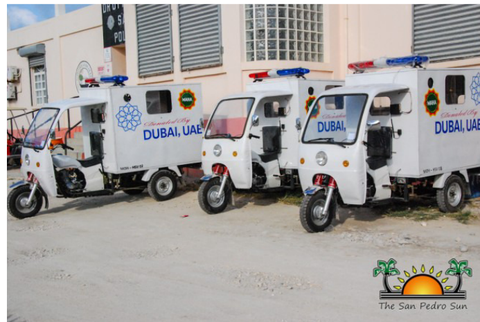
(medical support tuk-tuks parked at the Poly Clinic II in San Pedro)

services available for residents or tourists. Last April the government of Dubai, United Emirates, donated health support vehicles, known as tuk-tuks, to Belize. Three have been brought to Ambergris Caye and drivers have been trained to start using them. Tuk-tuks (motorized rickshaws), a common form of intra-urban transportation in Southeast Asia and the Middle East, are better known by Westerners as alternatives to taxis rather than medical transport. The environmental impact from the older diesel and compressed gas model tuk-tuks are not a significant risk factor on Ambergris Caye due the low incidence of motorized vehicles. Boats, golf carts, and bicycles are the primary modes of transportation on Isla Bonita.