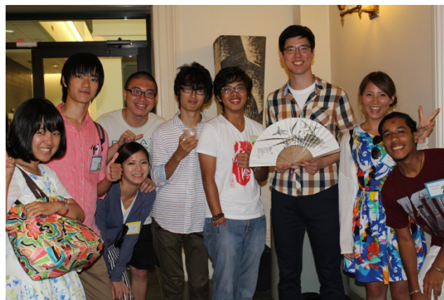
International students discover downtown Wilmington following reception at City Hall Sept 2

NOV 16 (Sunday) – Movie and a Dinner Exclusive Sister City dinner packages will be available for a specially selected festival film (TBA) & a post-show dinner for $40.00. Only 25 dinner packages will be available to see a premier film on the last day of the festival. Check the SCAW web calendar in the end of October for the film selection. The dinner is returning to the Rx Restaurant on Castle St. for Cucalorus 20. The prix fixe dinner includes a salad to start, choice of 3 entrees, and dessert. You have the option of running a separate bar tab, if you wish, or bringing your own bottle of wine and paying a $10 corkage fee. Anyone interested should reserve their tickets for a Movie & a Dinner package by November 10 by email – membership@scawilmington.org or phone – 910-343-5226.